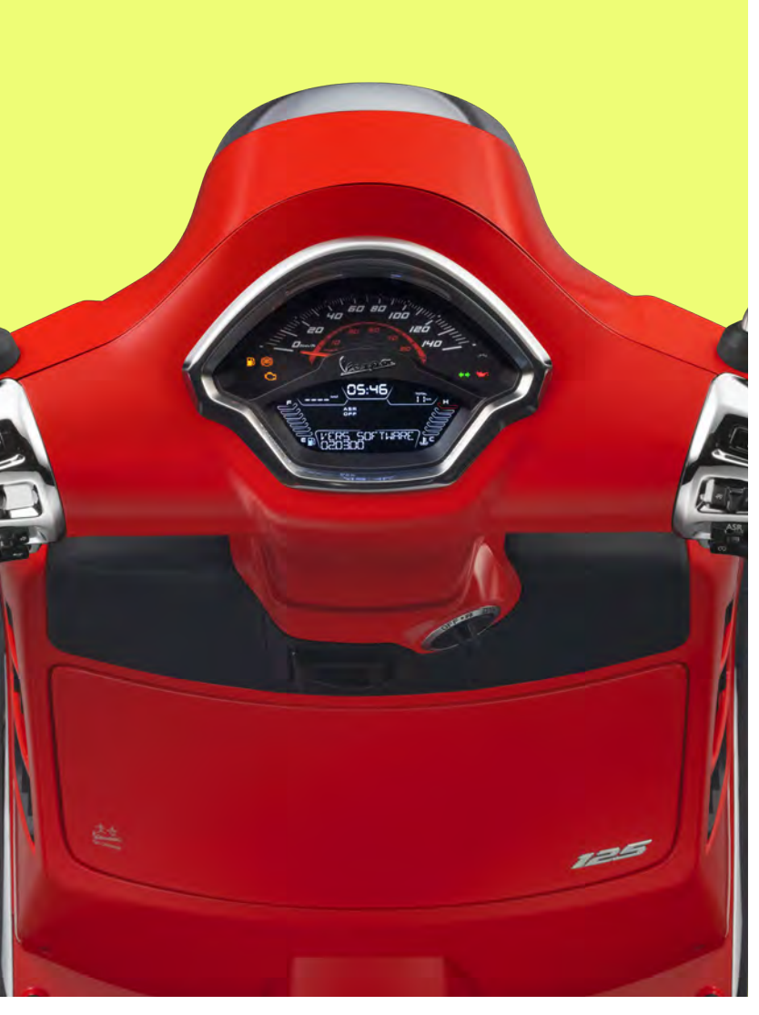
NEW DASHBOARD & KEYLESS