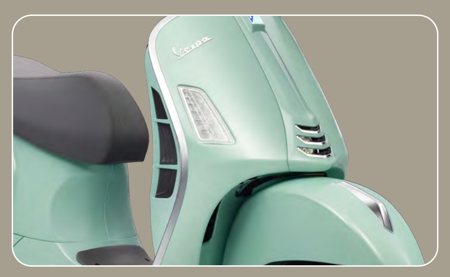
GLOSSY AND BRILLIANT METALLIC COLORS, WITH AN EYE TO THE VESPA TRADITION AND TO THE FUTURE